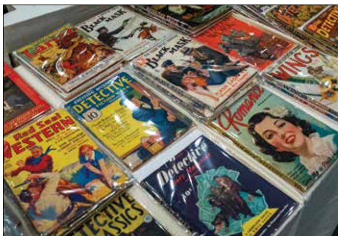
Pulps for sale in the dealers' room at PulpFest 2021